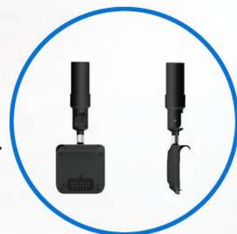
Removable High-precision Module

Open platform for 3rd party software applications.